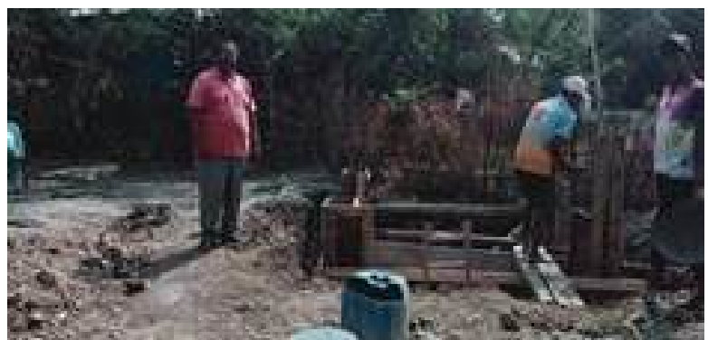
24 January 2025