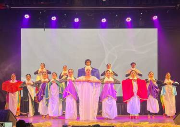
31 March 2025