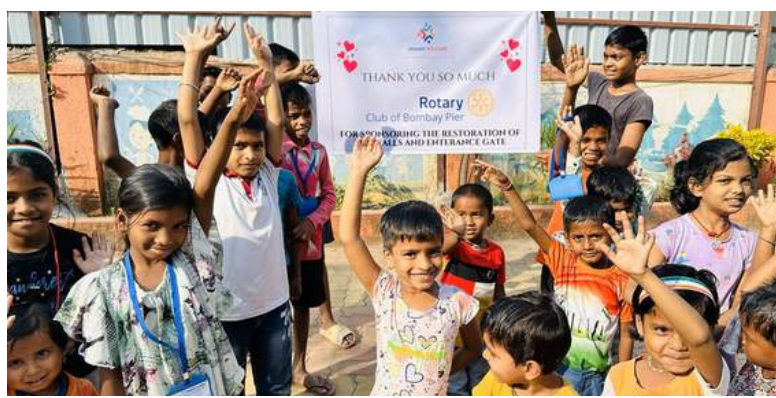
23 January 2025