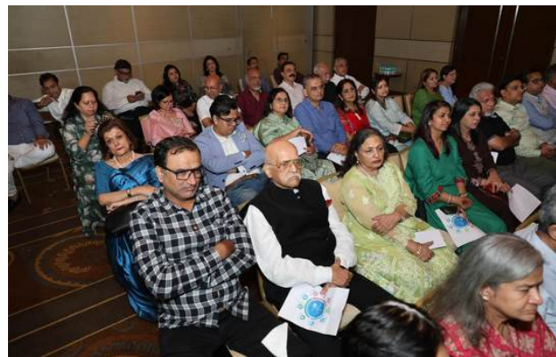
9 January 2025