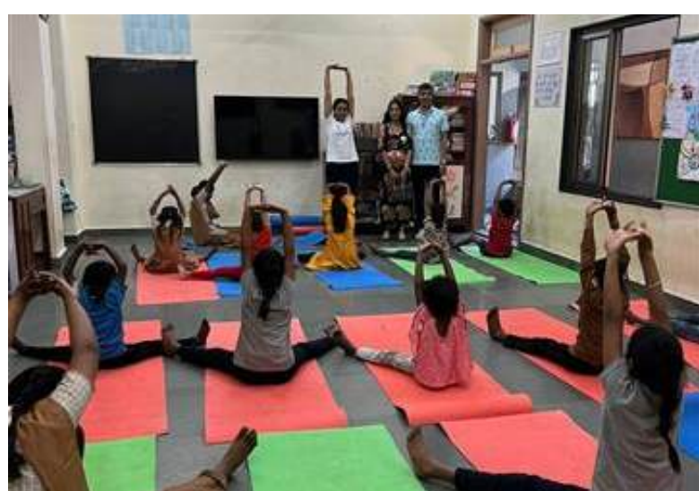
10 January 2025