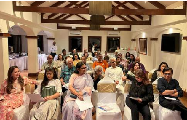
01 & 02 March 2025